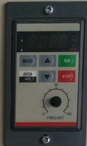
调速器 Speed Control